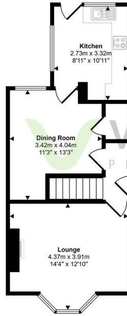
Ground Floor Approx 42 sq m / 450 sq ft

Approx Gross Internal Area 75 sq m / 805 sq ft